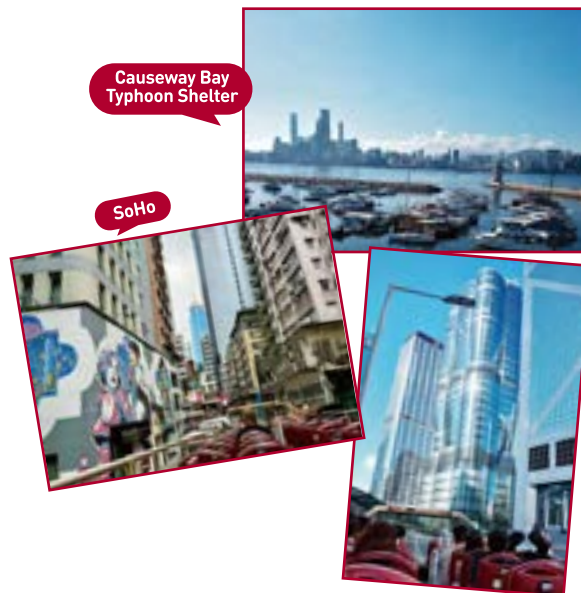
Causeway Bay Typhoon Shelter