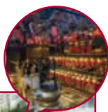
Man Mo Temple